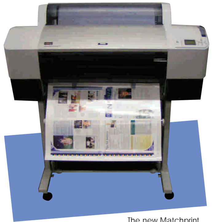
The new Matchprint Inkjet proofing system

Coastline customers will benefit from excellent colour accuracy, enhanced image smoothness and a proof which will closely match the press print.