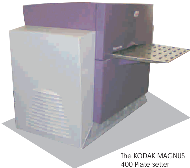
The KODAK MAGNUS 400 Plate setter

There is a lot of competition out there in the printing business, but we feel that we have the equipment and facilities to provide the very best results. With the investment we have made in high-end equipment we can react quickly to customer demands. The Kodak Magnus 400 plate setter came on line in July 2006 and has already streamlined Coastline Printing's productivity.